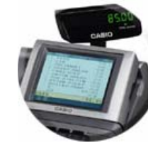
Casio QT-6000 Casio TE-7000 Casio TE-8500 TE-4500 coming