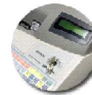
Sharp 410/420 Sharp 600/700