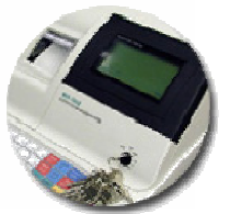
Sam4s SPS 2000 Sam4s 7000/7040